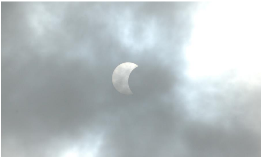
2017 Partial Eclipse, JY

-Observe the moment. No matter how close you are to line of totality interesting things are going to happen during the peak of the eclipse. The obvious part is the change in the light. Of course, if you are in the path, you will find all of the common unusual effects, darkness, chill in the air, change in sound and others. These obviously occur at lesser degrees outside of the path of the eclipse. It's easy to keep clicking away with a phone or a camera, but your senses are also great ways to capture the experience. How ever you choose to view, enjoy it because there will not be another total eclipse whose path crosses the continental US until 2044.